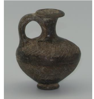
Ceramic Pitcher, ca. 1730-1550 BC Canaanite (Israel) Gift of MAW