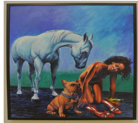
Horse Tails (2 nd Place) George Oswalt oil