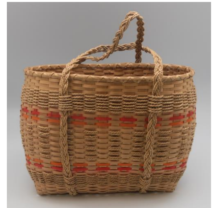
Basketry Purse, ca. 2000 Penobscot (Northeast)

Museum Purchase, Nathaniel and Lana Grey Collections Fund