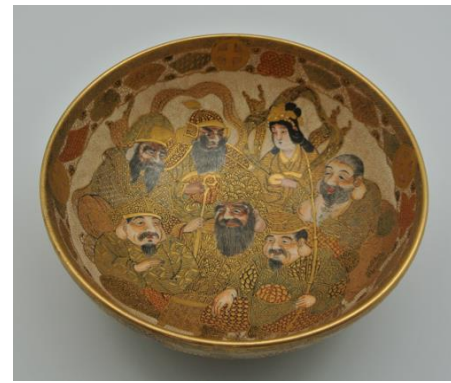
Bowl Depicting Seven Gods of Good Fortune, ca. 1880-1925 Japan