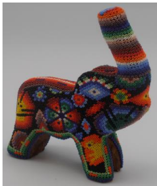
Beaded Elephant, ca. 2000 Huichol (Mexico)