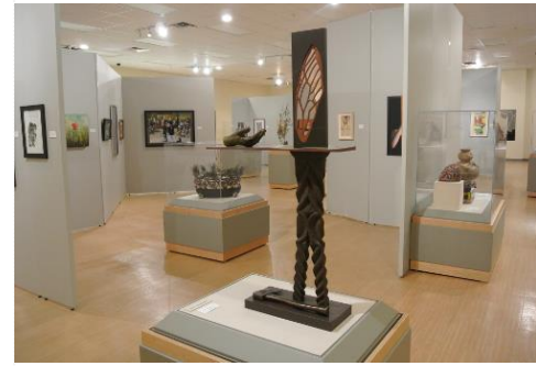
Seven-State Biennial Exhibition installed in the M.J. "Jack" Bell Hall of the Mary H. Herron Community Conference Center

Recent Acquisitions (Sept 20 - Jan 8, 2017)