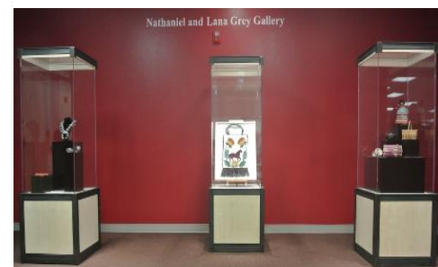
Nathaniel and Lana Grey Gallery