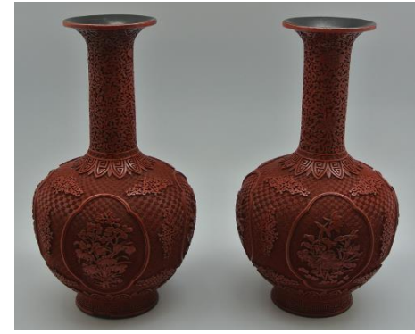
Vases, late 19 th /early 20 th century Chinese Gift of Wally Mason