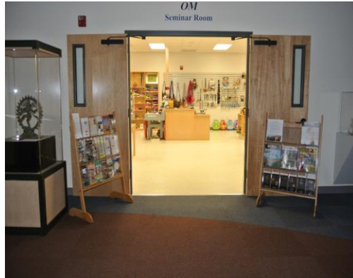
Museum Store in the OM Seminar Room