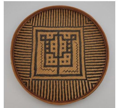
Basketry Tray, ca. 1990 Amazonia