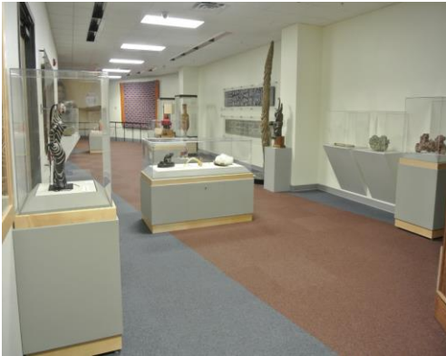
Conference Center Hallway