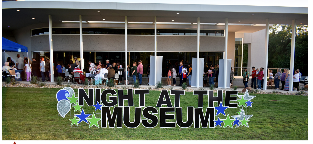
The Southeastern Public Library System of Oklahoma and the Museum of the Red River teamed up for our first ever Night at the Museum. Over 900 people of all ages attended the event!

A s we approach the end of the year, we look back on 2019 as an impressive and monumental year. Not only have we finished the renovations for every area of the Musuem, we have also had many amazing events and progroms that have brought thousands of people through our doors. Now our eyes are turned towards 2020, and we're excited to continue providing for the community.