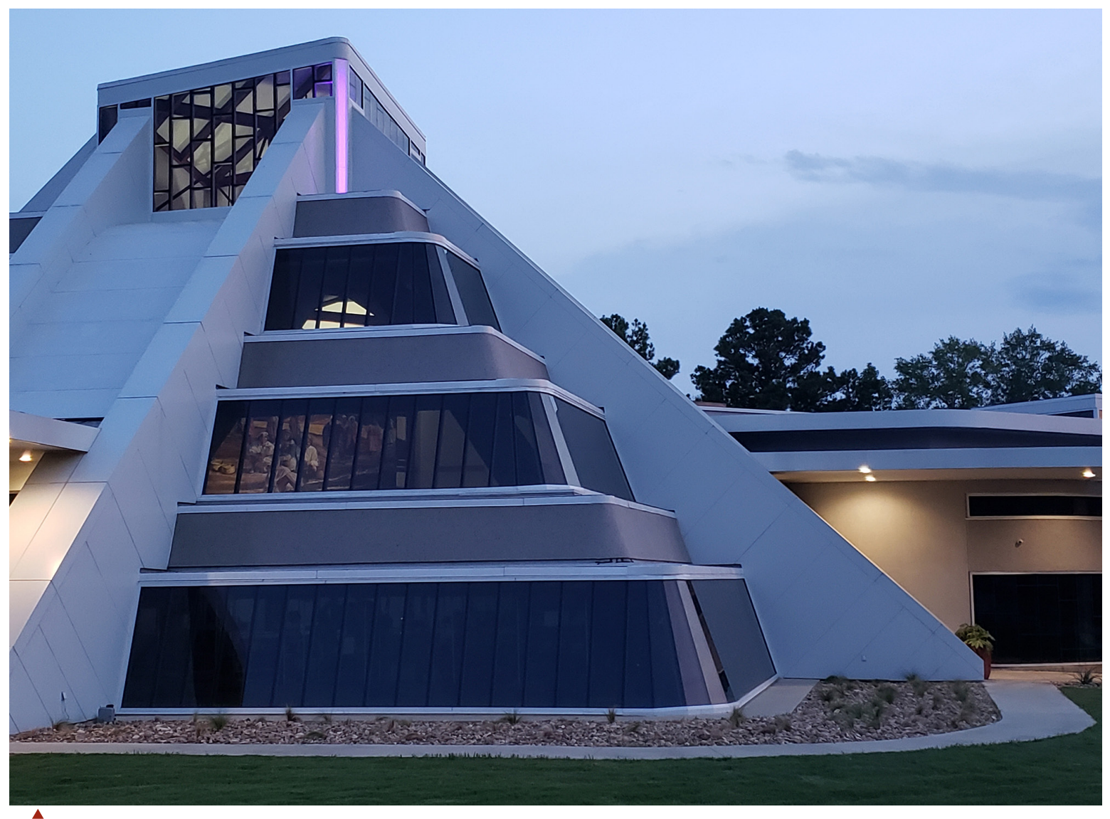
The latest addition to the front of the Museum is a color changing light at the top of the pyramid that can be seen at night! It cycles through several colors including red, white, and turquoise.