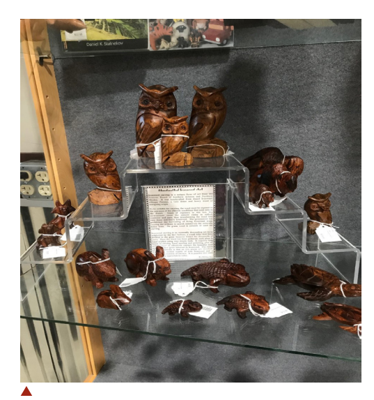
Since opening, Books & Baubles has drawn in several customers with a vast selection of books and unique items like these ironwood animals .