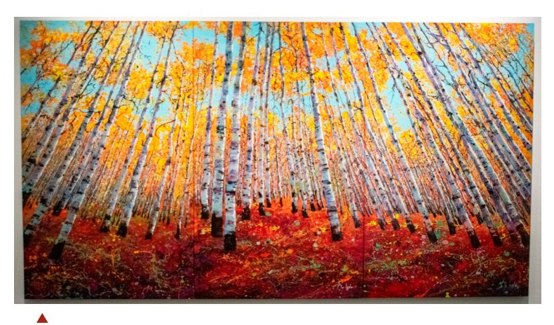
Twilight (2019) by Roberto Ugalde; acrylic on canvas

Two artists working in the American Southwest, Ugalde and Archuleta express their colorful visions in very different ways. Ugalde magnifies the colors of vegetation, particularly trees. His favorite is the aspen which provides various shades of color through the seasons which he then highlights dramatically. Archuleta draws inspiration from the animal world and is particularly well-known for his Blue Donkey series. This exhibit was facilitated by Michael McCormick and Sons Gallery in Taos, NM .