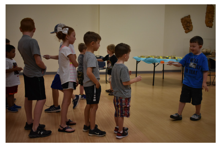
Children who attended Dino Camp 2019 in July enjoyed several fun activities, including doing the dino dances (left) and competing in dino egg races (right).