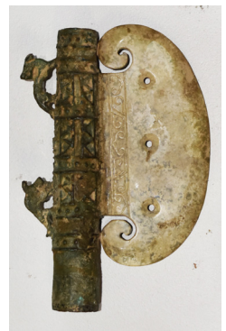
Halberd Axe, ca. 500 BC, China Museum Purchase