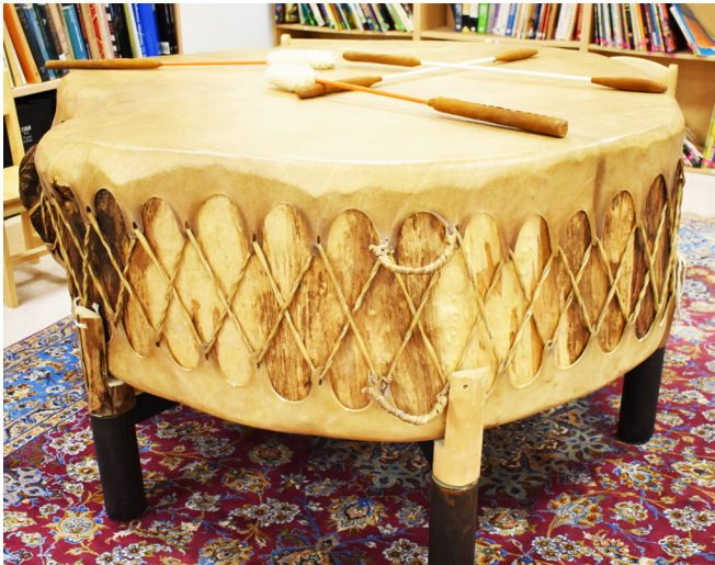
"Pow-wow" Style Drum, Cottonwood tree trunk with stretched American buffalo ( Bison bison ) hide