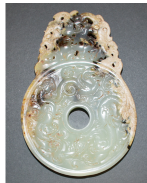
Bi Disc, ca. 750-220 BC, China, Gift of Drs. Ernesto and Luisa Lira

Molas are colorful "reverse applique" textile panels created by the Kuna of the San Blas Islands off the northeast coast of Panama. They were originally decorative shirt panels, with imagery captured from folk and contemporary popular culture. Traditionally a folk craft of women, molas have become a major sale item for tourism dollars, providing significant income. Their creation has since been adopted by all members of society.