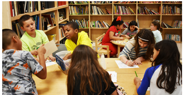
School group exploring books and coloring activities in the childrens library area of the learning center