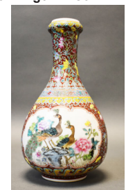
Vase , ca. 1908-1912, China, Museum Purchase