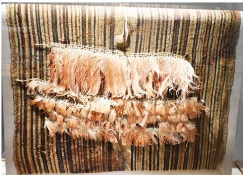
Poncho with attached feather strips, ca. 100BC-AD200, South Coast Peru, Gift of Quintus H. and Mary H. Herron

Inspired by Museum founders Quintus and Mary Herron , this exhibit space celebrates the Museum's permanent collections, highlighting some of the finest examples of material culture from around the world available for public appreciation.