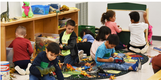
Children interacting with dinosaur figures