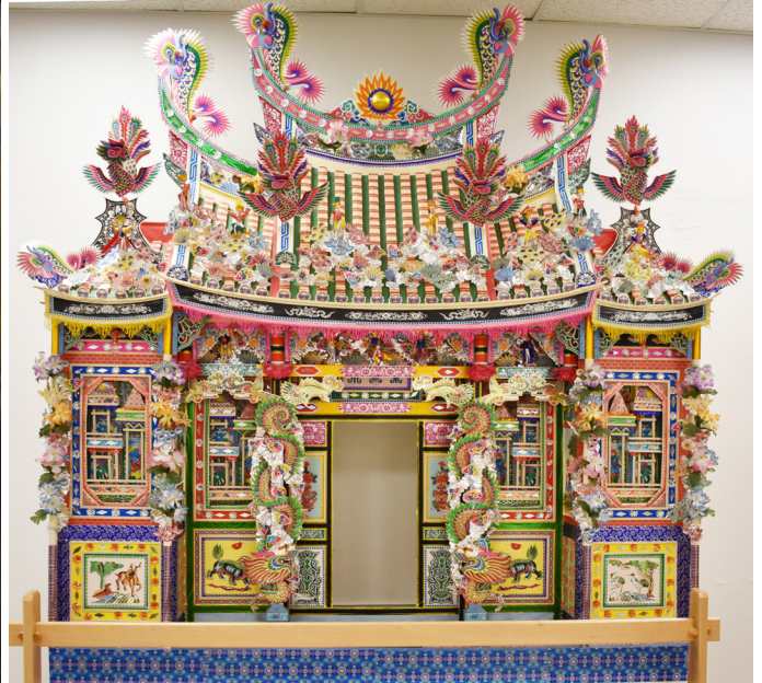
Paper and wood House Model, ca. 1970, Gift of Chinese American Museum of Chicago , Raymond & Jean T Lee Center